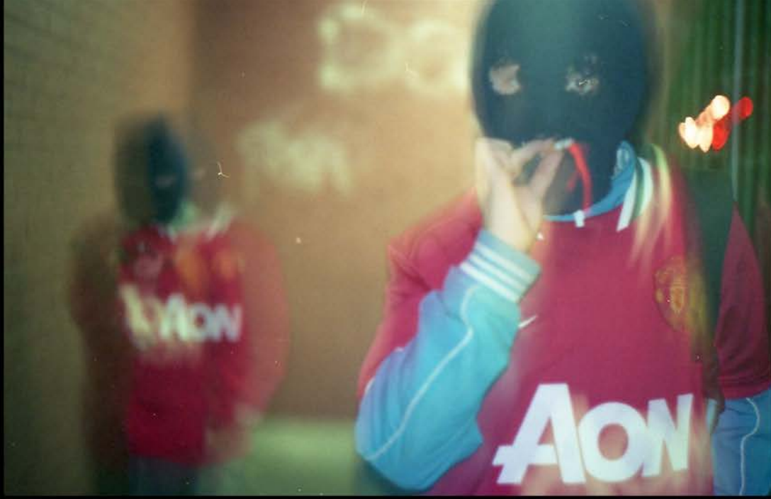
2014